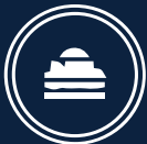
TABLE MOUNTAIN AERIAL CABLEWAY 9.8km

Table Mountain is one of the 7 wonders of nature. While you stay with us we highly recommend that you either hike up the mountain or use the cableway. The cableway is disability accessible. While tickets are still available on site, buying them in advance gives you fast access to the cable car. A trip up the mountain is educational as well as breathtaking, learn about the natural flora and fauna and the formation of our beautiful mountain. Table Mountain is a definite must-see!